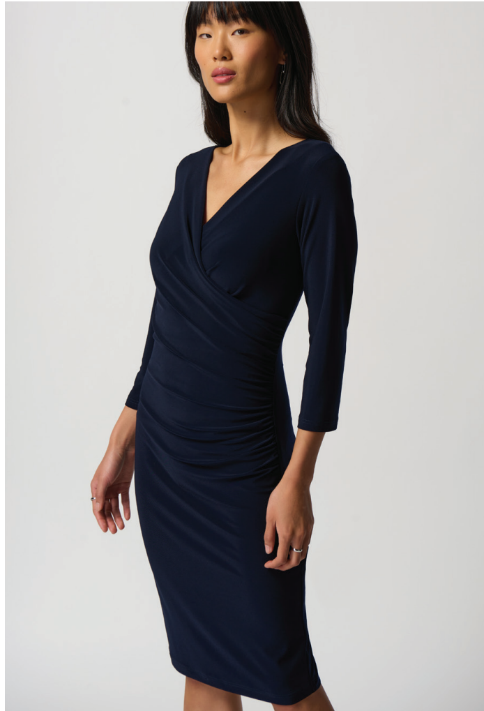
Three-Quarter Sleeve Wrap Dress 233305NOS