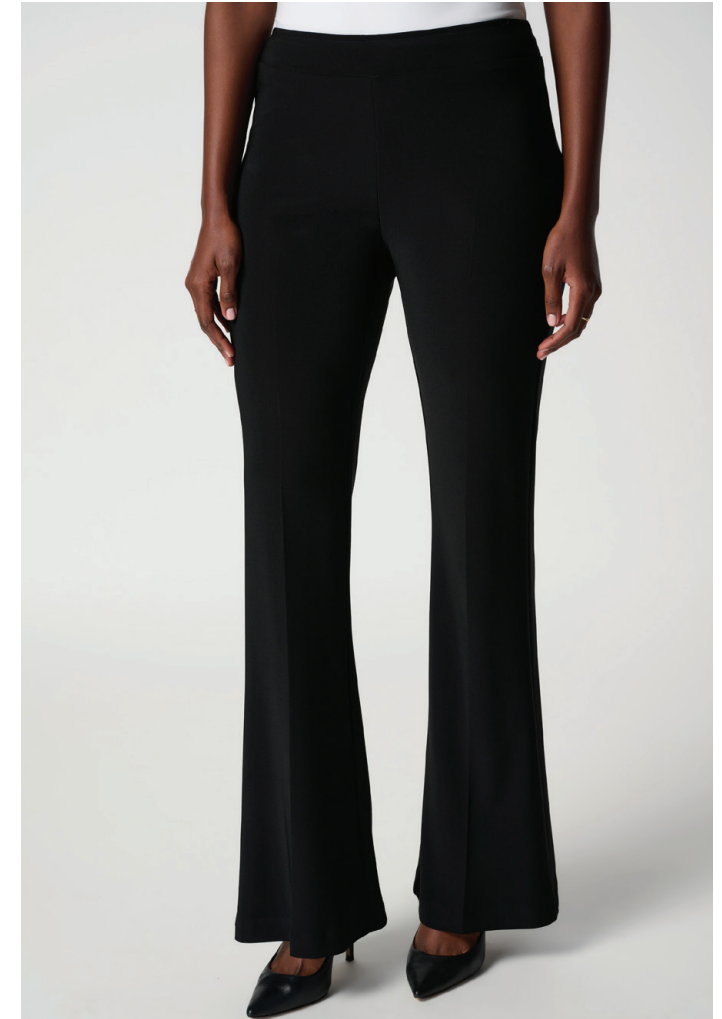
Classic Flared Pant 163099NOS