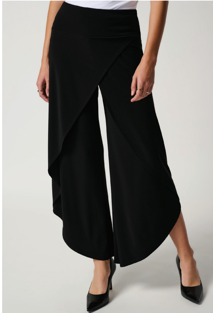
Classic Overlay Pant 211494NOS