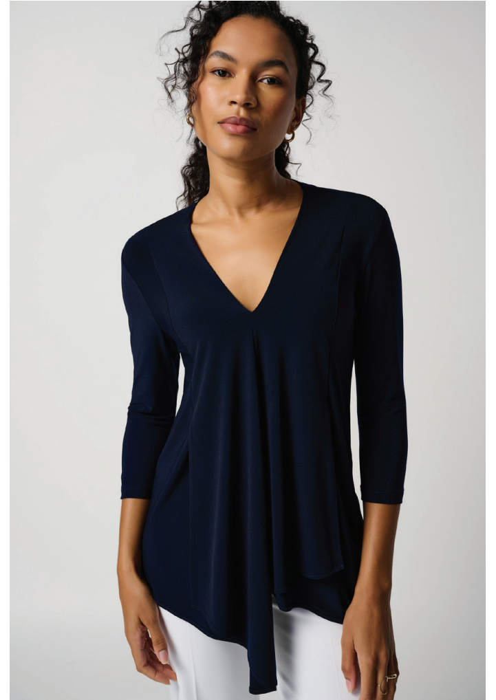
Asymmetric Tunic 161066NOS