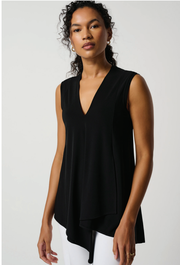
Sleeveless V-Neck Tunic 161060NOS