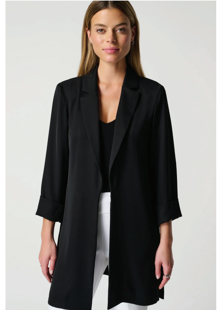
Classic Long Blazer 211361NOS