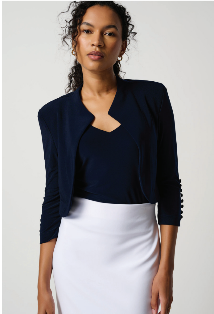
Classic Bolero 213707NOS