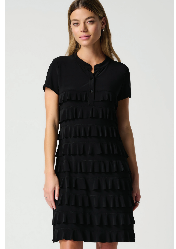
Ruffle Dress 211350NOS