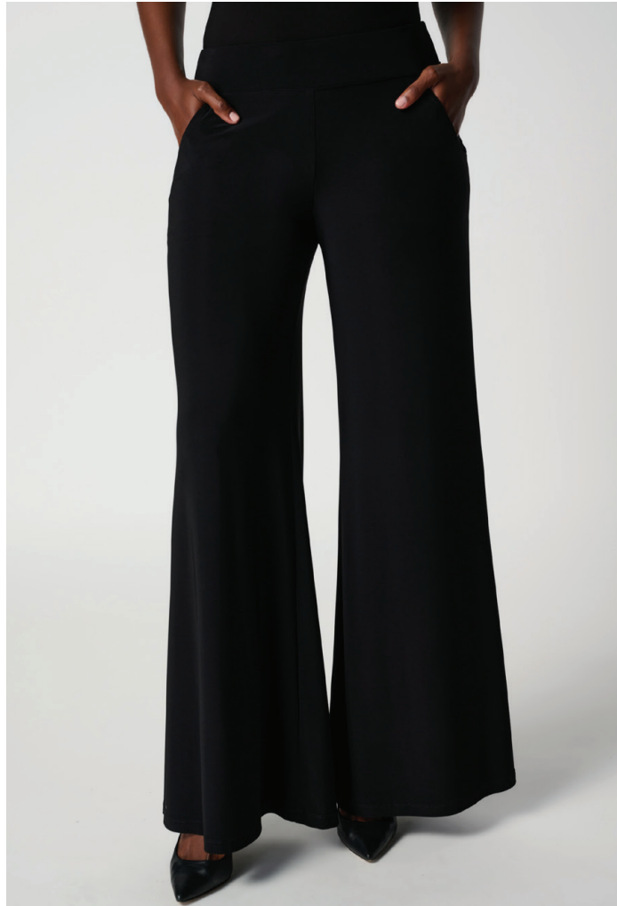
Classic Palazzo Pant 161096NOS