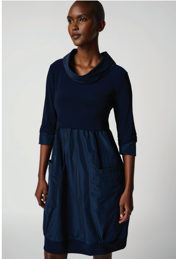
Cocoon Dress 173444NOS