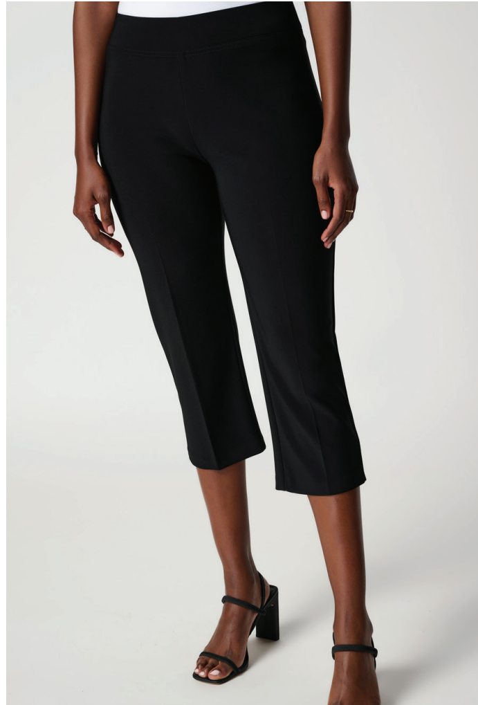
Classic Capri Pant C143105NOS