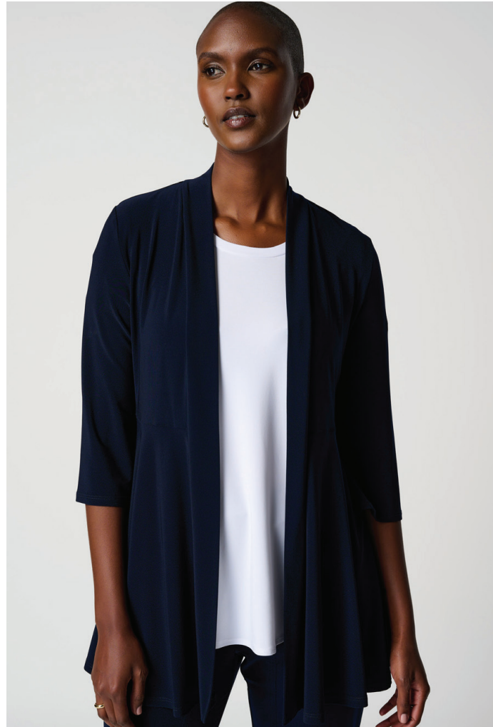
Long Overpiece 201547NOS