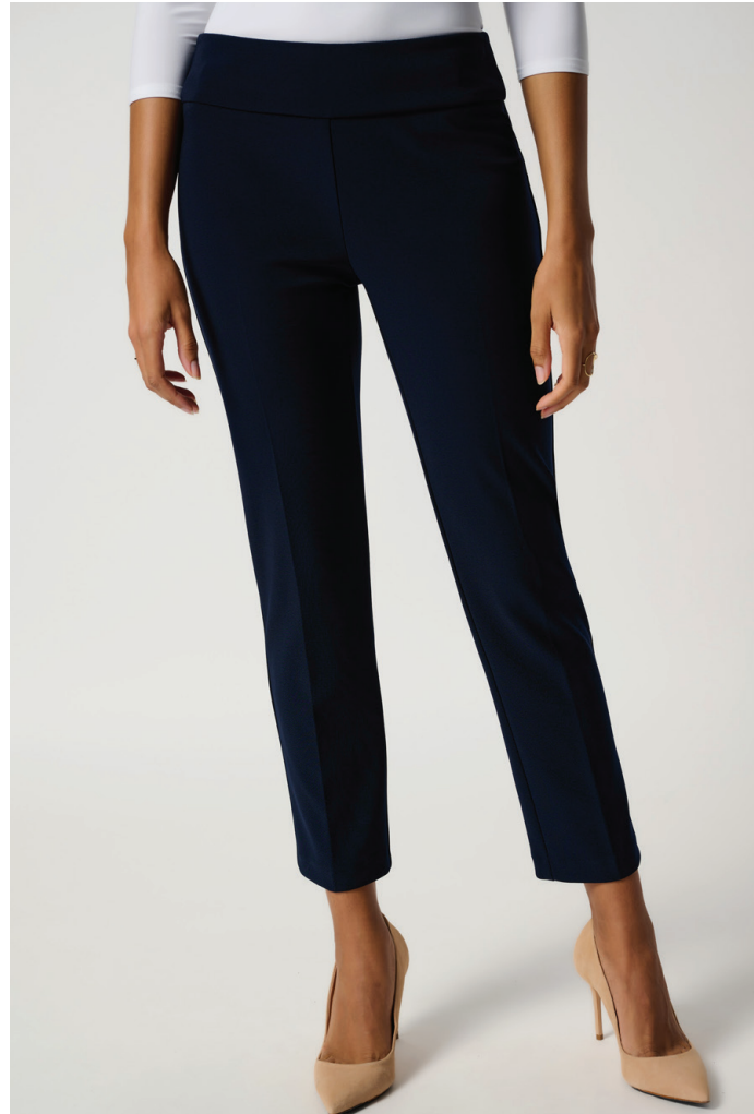
Classic Cropped Pant 181089NOS