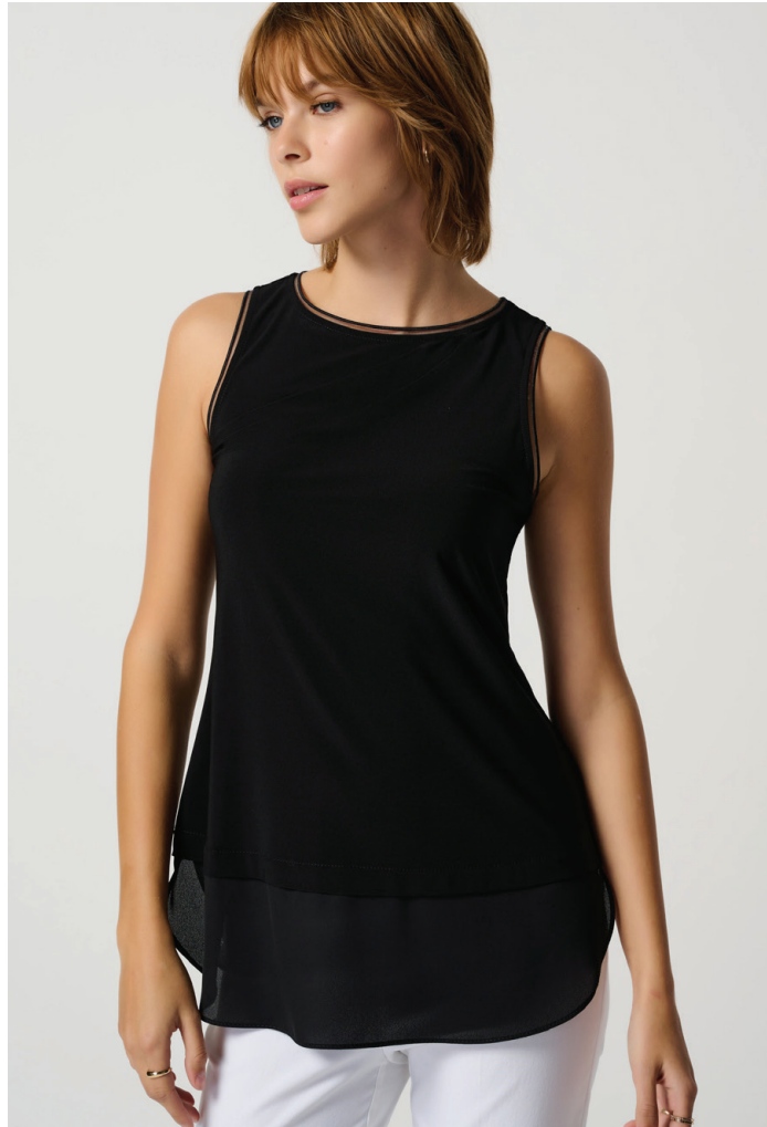
Layer Hem Cami 183126NOS