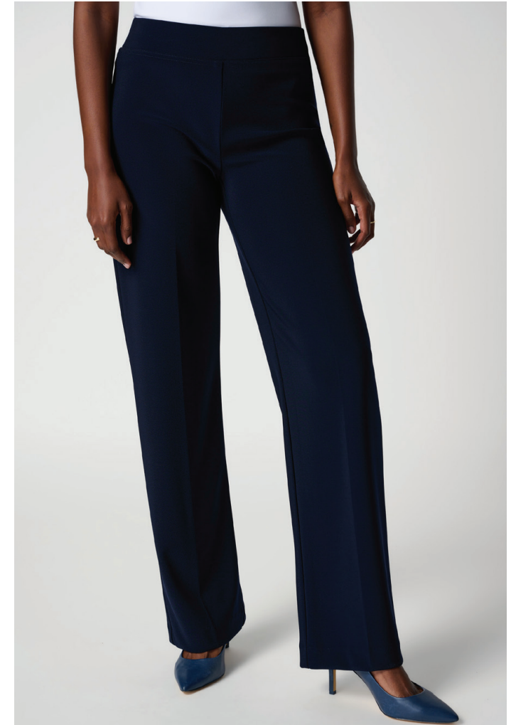
Classic Wide-Leg Pant 153088NOS