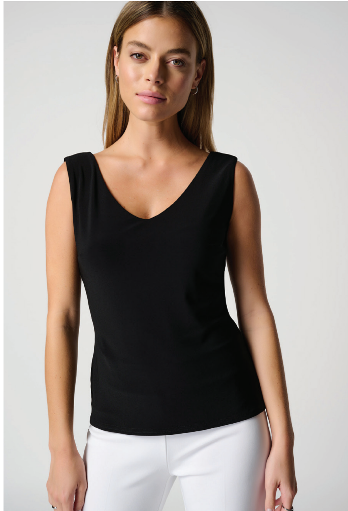
Classic V-Neck Cami 201546NOS