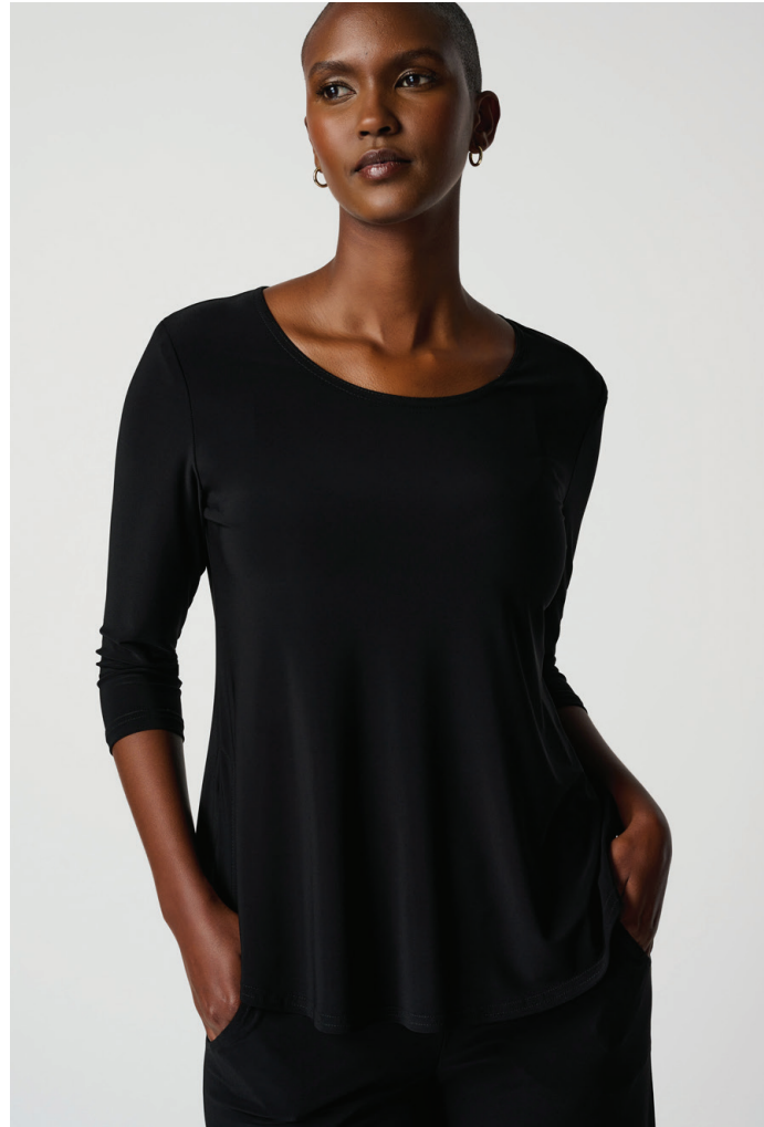
Classic Three Quarter Sleeve T-Shirt 183171NOS