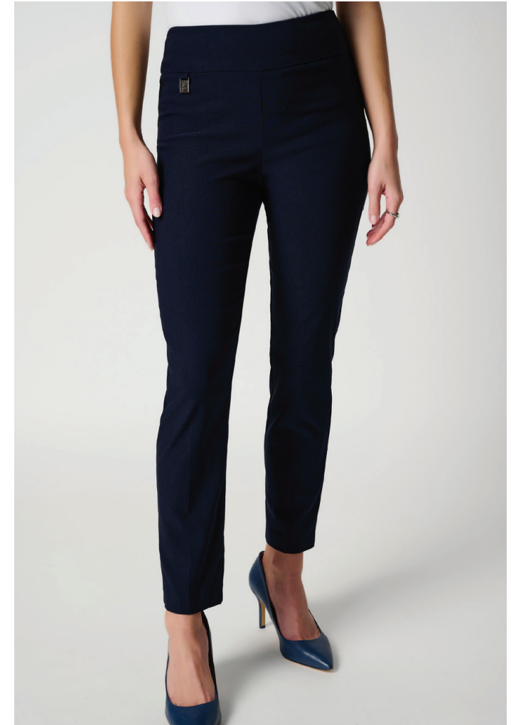
Classic Slim Pant 201483NOS