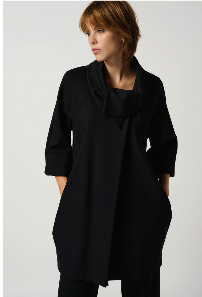
Classic Cocoon Coat 153302NOS