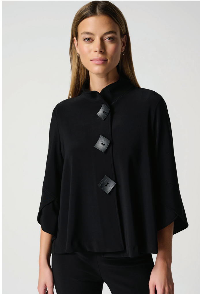
Classic Trapeze Jacket 193198NOS