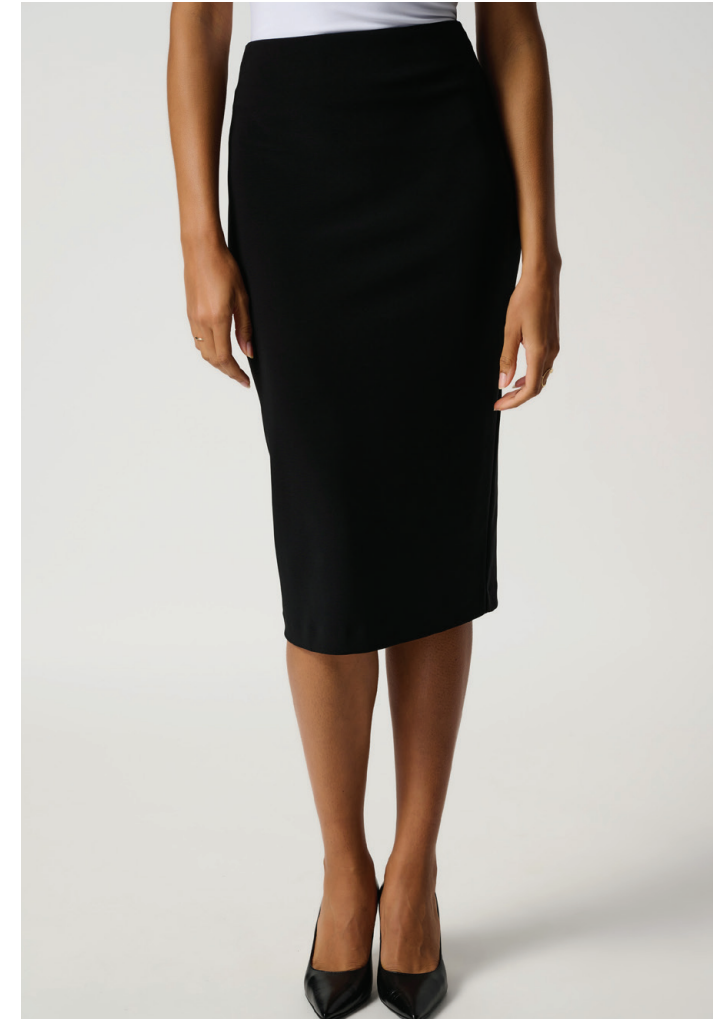
Classic Long Pencil Skirt 163083NOS