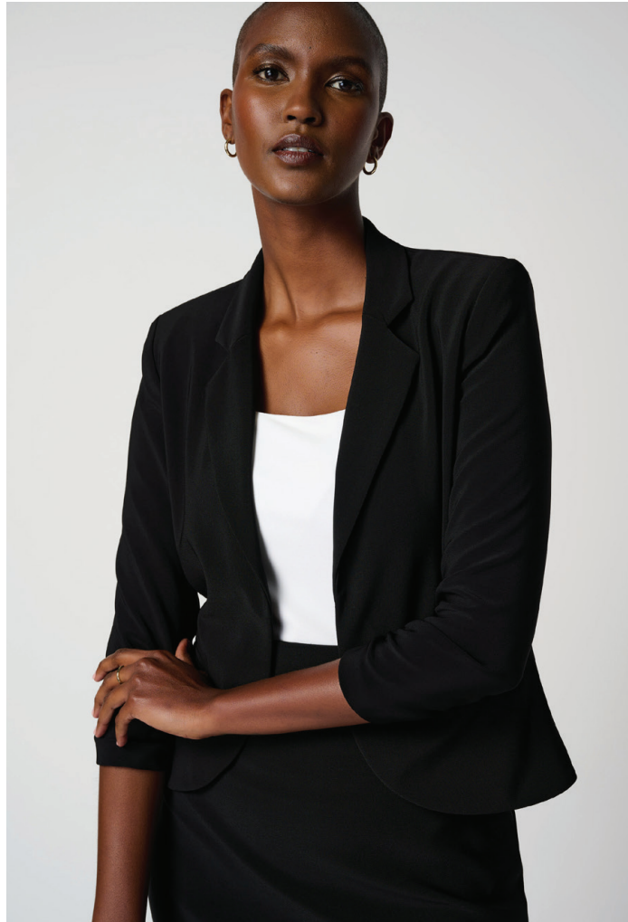
Classic Blazer 143148NOS