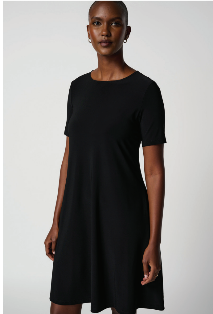
Classic A-Line Dress 202130NOS