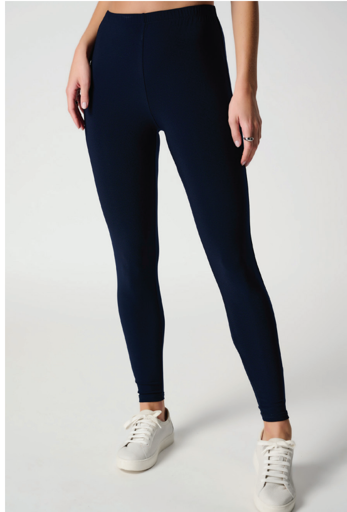
Classic Leggings 163096NOS