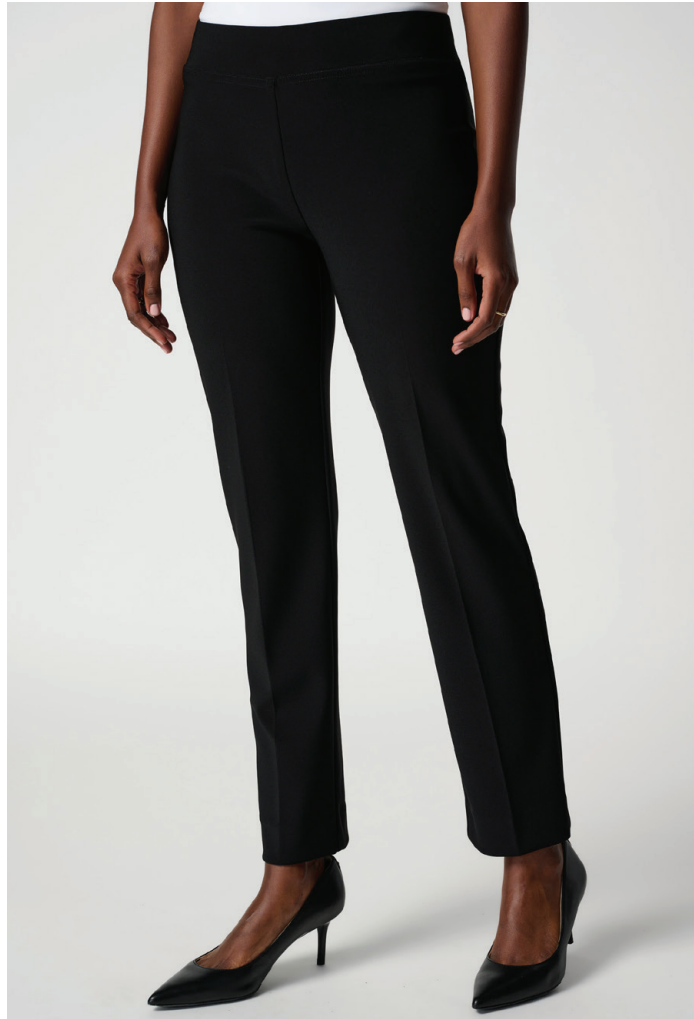
Classic Straight Pant 143105NOS