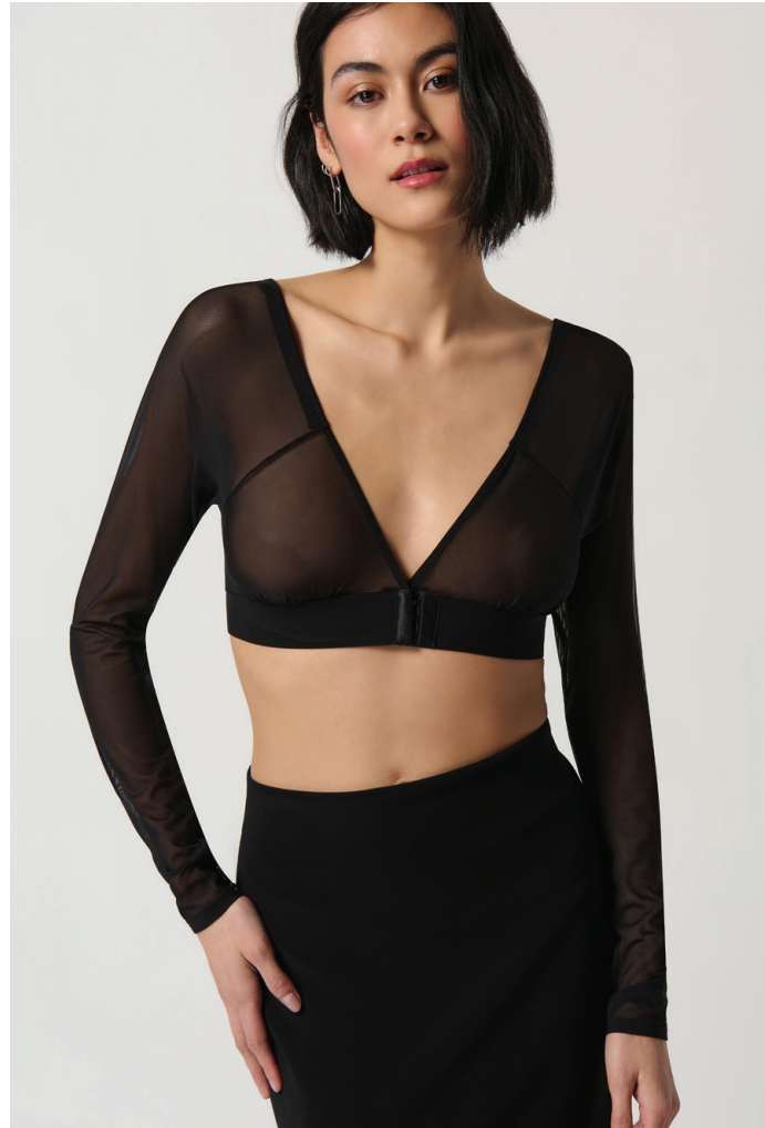
Shadow Sleeves 233977NOS