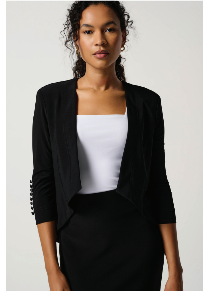
Tux Overpiece 161140NOS