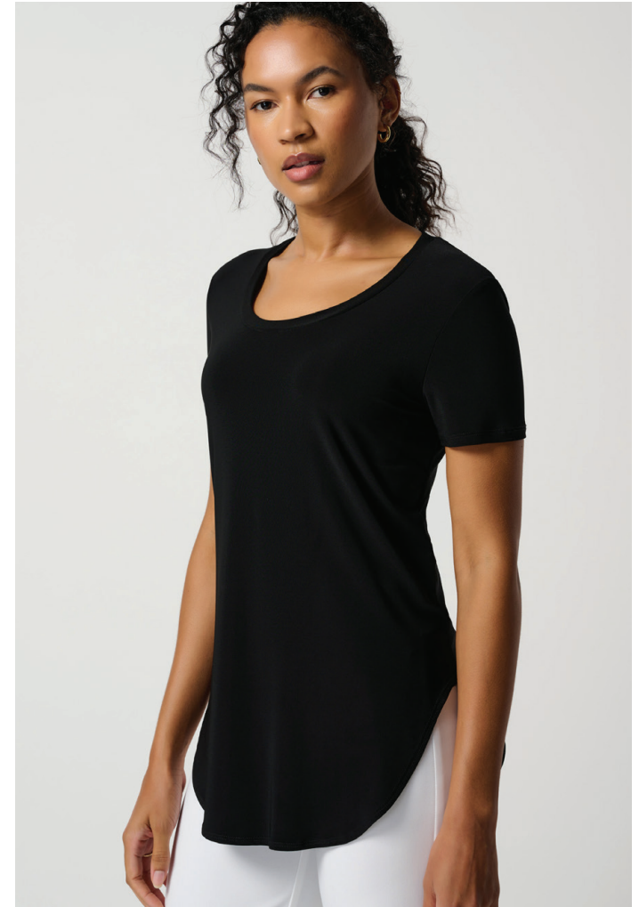
Classic T-Shirt 183220NOS