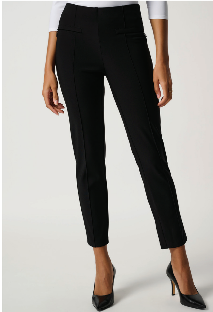
Classic Structured slim pant 171094NOS