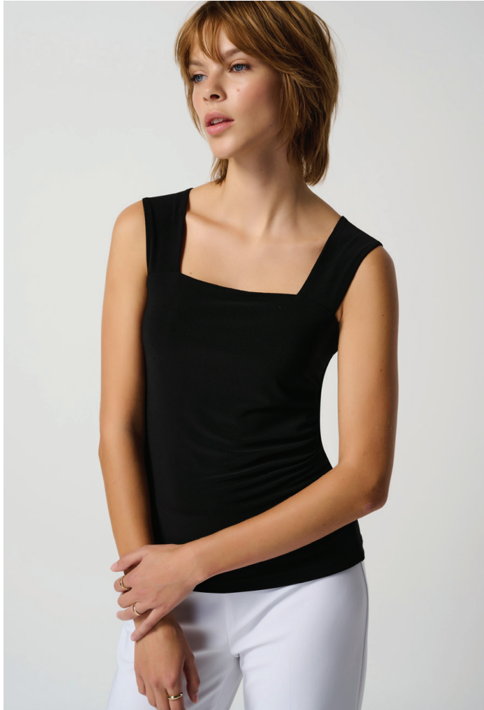
Classic Square Neck Cami 143132NOS