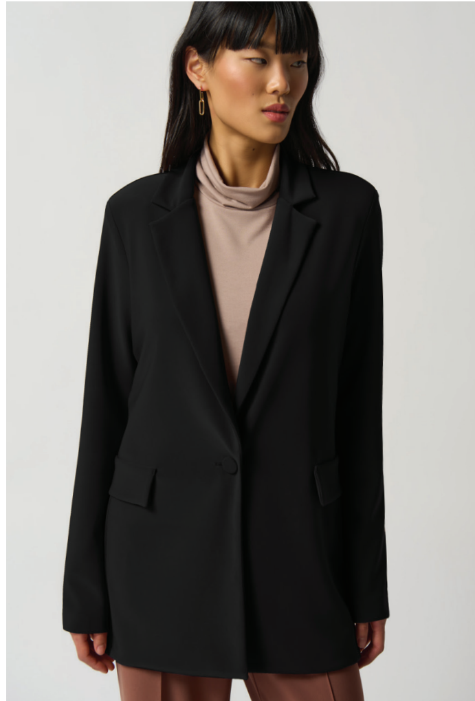
Straight Blazer 231064NOS