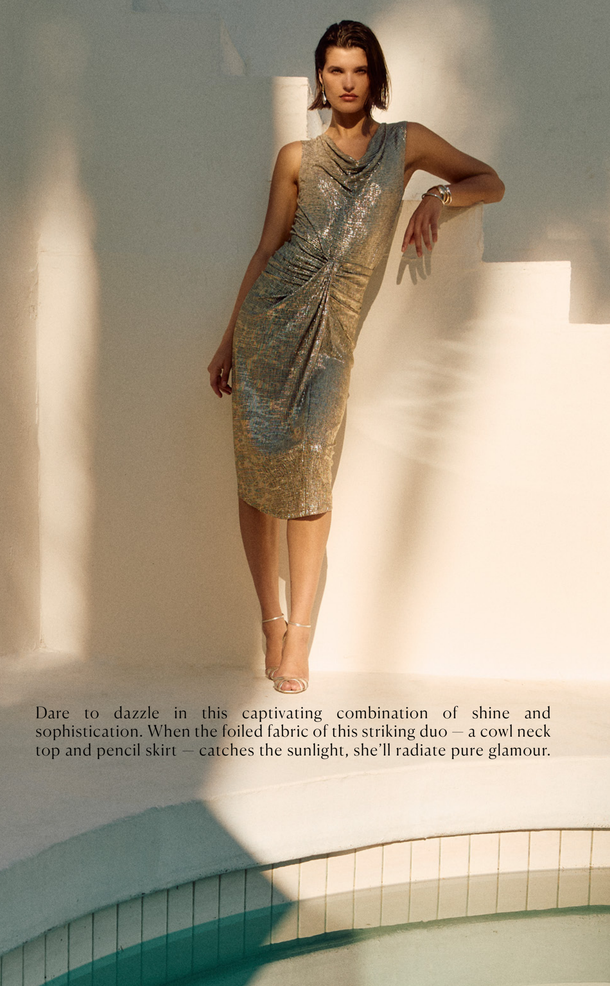
Dare to dazzle in this captivating combination of shine and sophistication. When the foiled fabric of this striking duo — a cowl neck top and pencil skirt — catches the sunlight, she'll radiate pure glamour.