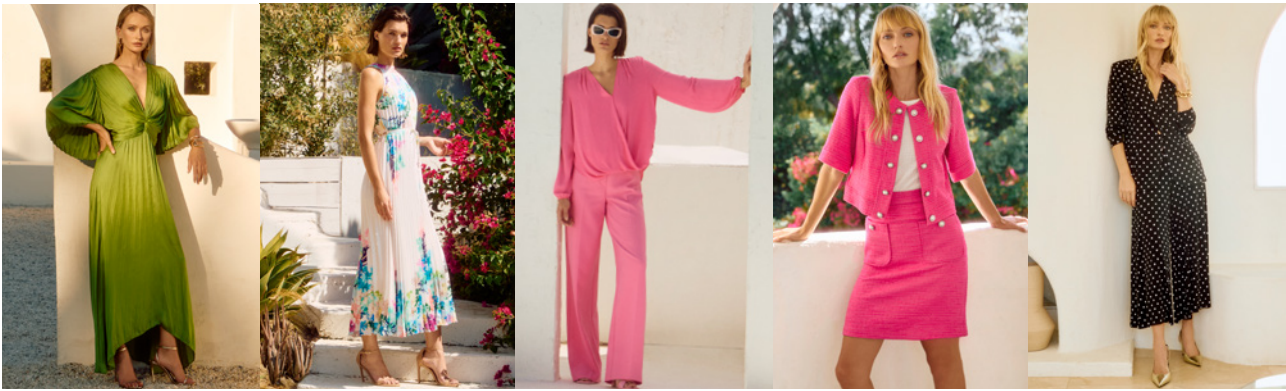
COVER 251903 P4-5 251904 P6 251172 251161 P7 251196 251167 251291 P8-9 251051 251040